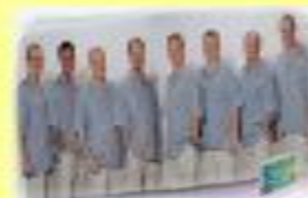
Band of Oz Saturday Noon