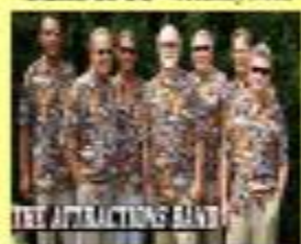
The Attractions Saturday Afternoon